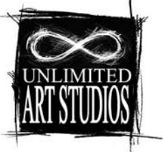
Illustration Request FAQ's